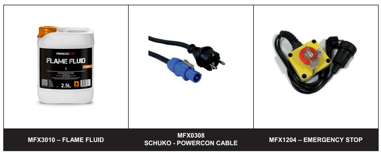
Figure 9: Accessories Flamaniac

The items listed can be ordered from your MAGICFX® distributor. Locate a distributor near to you by contacting;